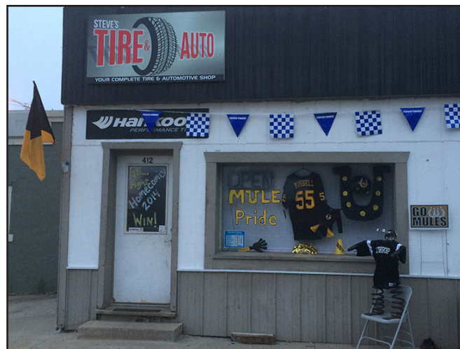
2014 Storefront Spirit Contest 1st Place Winner - Steve's Tire & Auto

ALL Businesses are encouraged to participate!